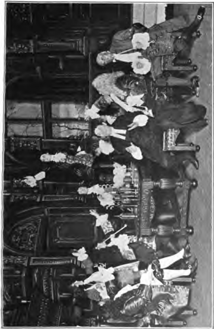
They filled their glasses and lifted them and shouted admiring jests to her.